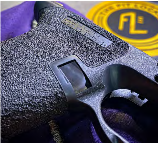
❑ White Noise ($250)