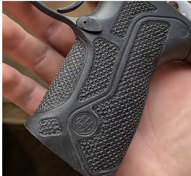
❑ Trilo ($250)