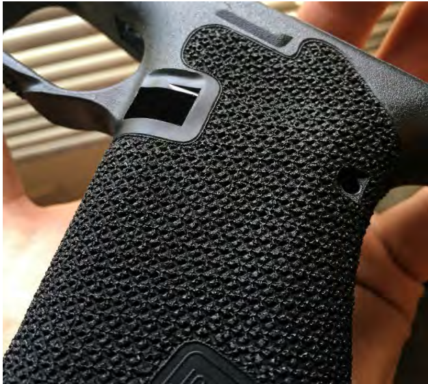
❑ Noir ($250)