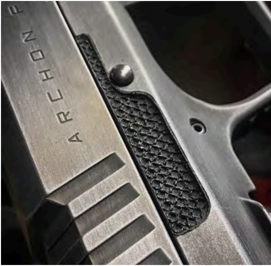
Keystone Index ( + $28)