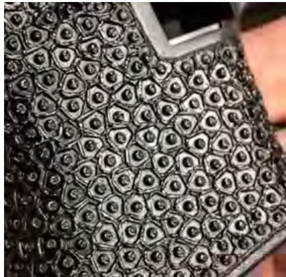
❑ Gator ($175)