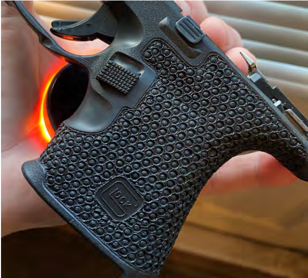
❑ Oculus ($175)