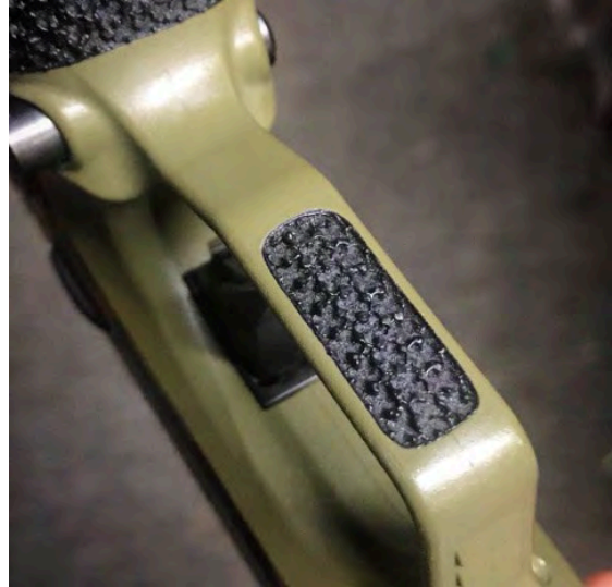
Beavertail Dehorn ( + $35)