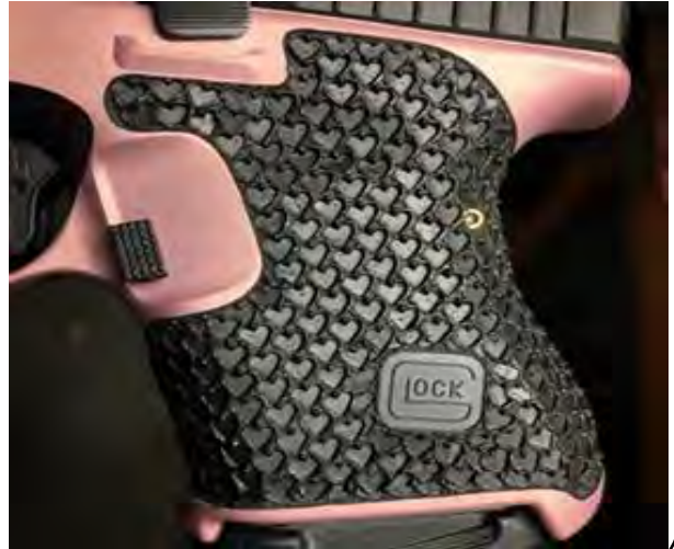
❑ Valentine ($225)