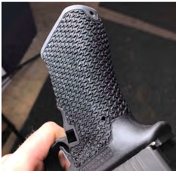
❑ Chainsaw ($225)