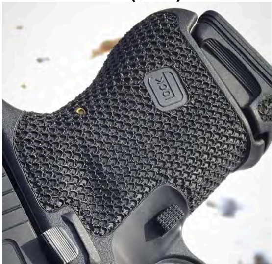
❑ Trilo ($225)