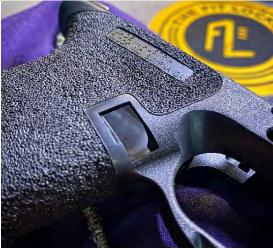
❑ White Noise ($225)